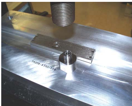
Figure 3. Galled Test Button and Block