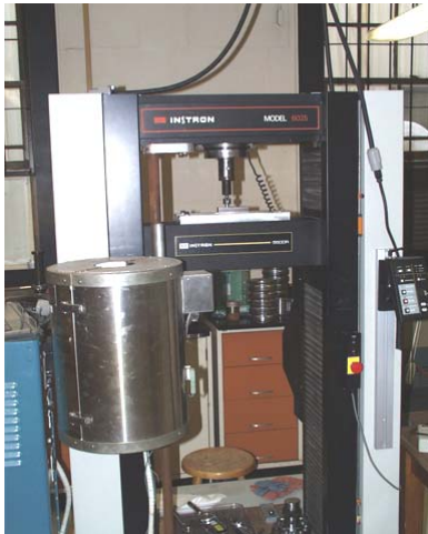
Figure 1. Intron Compression Test Machine

The test procedure is simple. Half inch diameter monel "buttons" were loaded in compression against a stainless steel block. The button was then rotated through 360 degrees, the material couple was unloaded, separated and checked for evidence of galling. This procedure was repeated for various loads until a transition between galling and no galling was determined. Figures 1-3 show the overall test set-up and an example of a galled material couple.