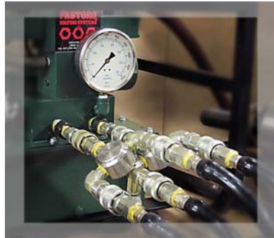
TB3 Manifold with two hose sets

4. Press the Advance Button on the remote control to extend the Flange Puller cylinders and draw the flange halves closer together.