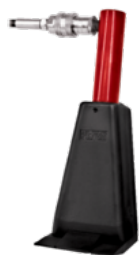
Hydraulic Flange Spreader, Qty 1 HS10K