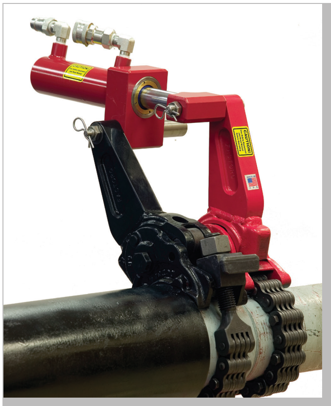
Low profile unit

For piping connections with space restrictions, an optional Low Profile Reaction Unit is available. It incorporates ZipNut Technology for fast installations and removal on the pipe. Specific information available upon request.